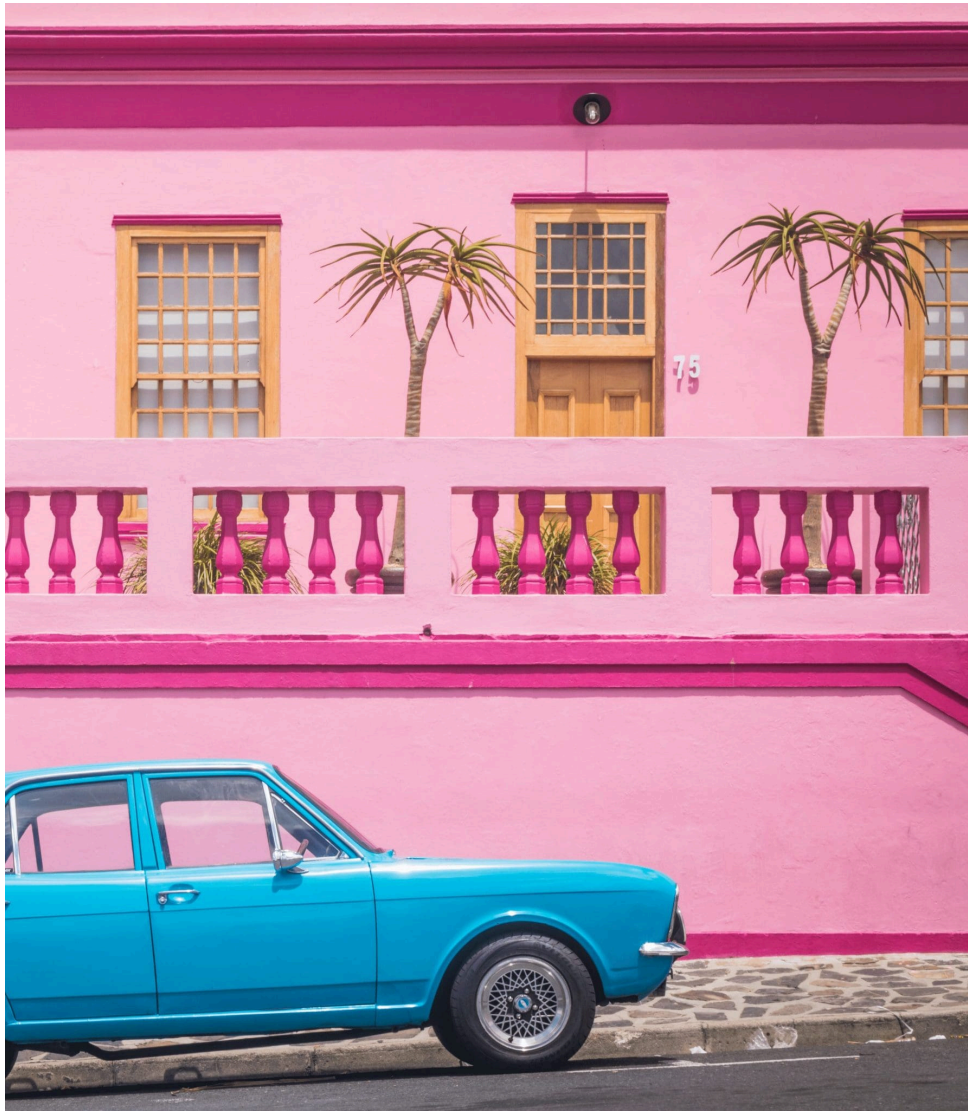
Photograph by Claudio Fonte