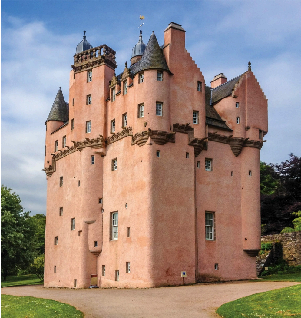
Craigievar Castle, Scotland

Said to be the inspiration for Walt Disney's Cinderella castle, this beautiful grand dame is surrounded by rolling gardens and ancient trees. While you can't stay in the castle itself – there are rental cottages on the property – you are able to tour the heritage site, view its many artefacts, artworks and antiques, and walk the gardens at leisure. @craigievar_castle ( https://www.instagram.com/craigievar_castle/ ).