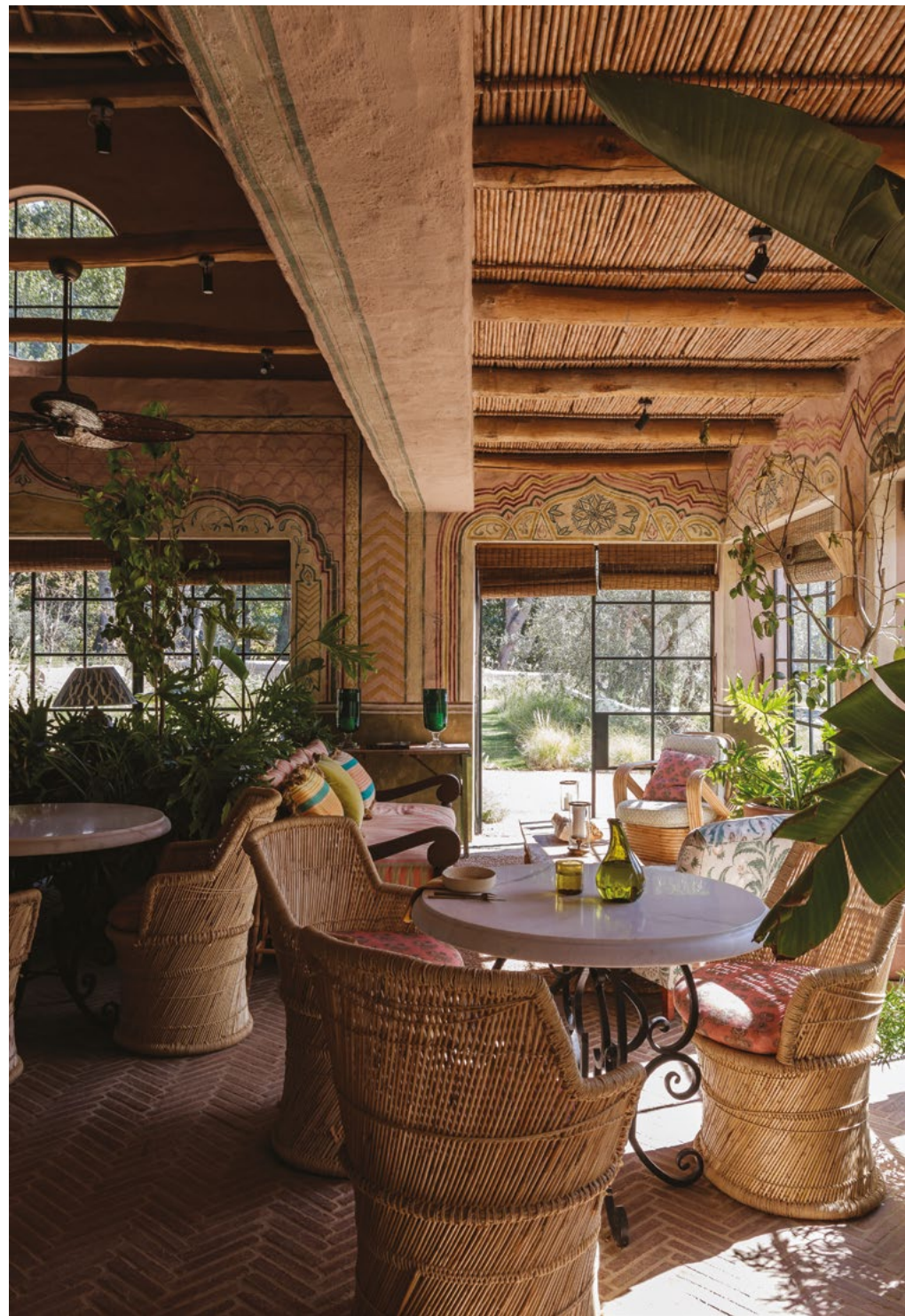
Right, clockwise from top left Sweet little design and decor details can be discovered in every corner. A view of the garden from the scullery. A vegetable mural in the kitchen was painted by the couple's friends, Keith and Di Christian. Harvesting fresh produce is par for the course at Sterrekopje. Above, from left A long wooden table with benches stretches the entire length of the U-shaped courtyard, where the olive trees cast beautiful reflections. The café-style living area offers many moments for guests to enjoy the soft morning light, or take shelter from the afternoon sun.