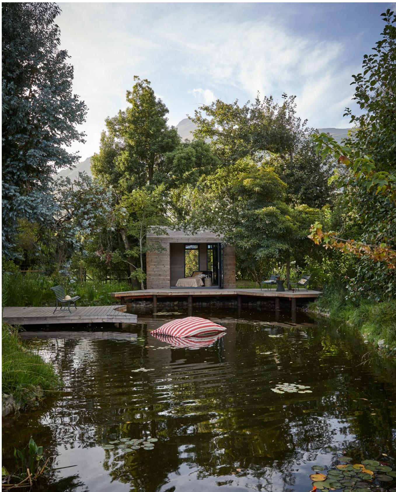
This spread Nick's office pod – a separate bolthole from the main house – overlooks a serene pond that took quite some tenacity to build, but is now a pivotal part of this family homestead.