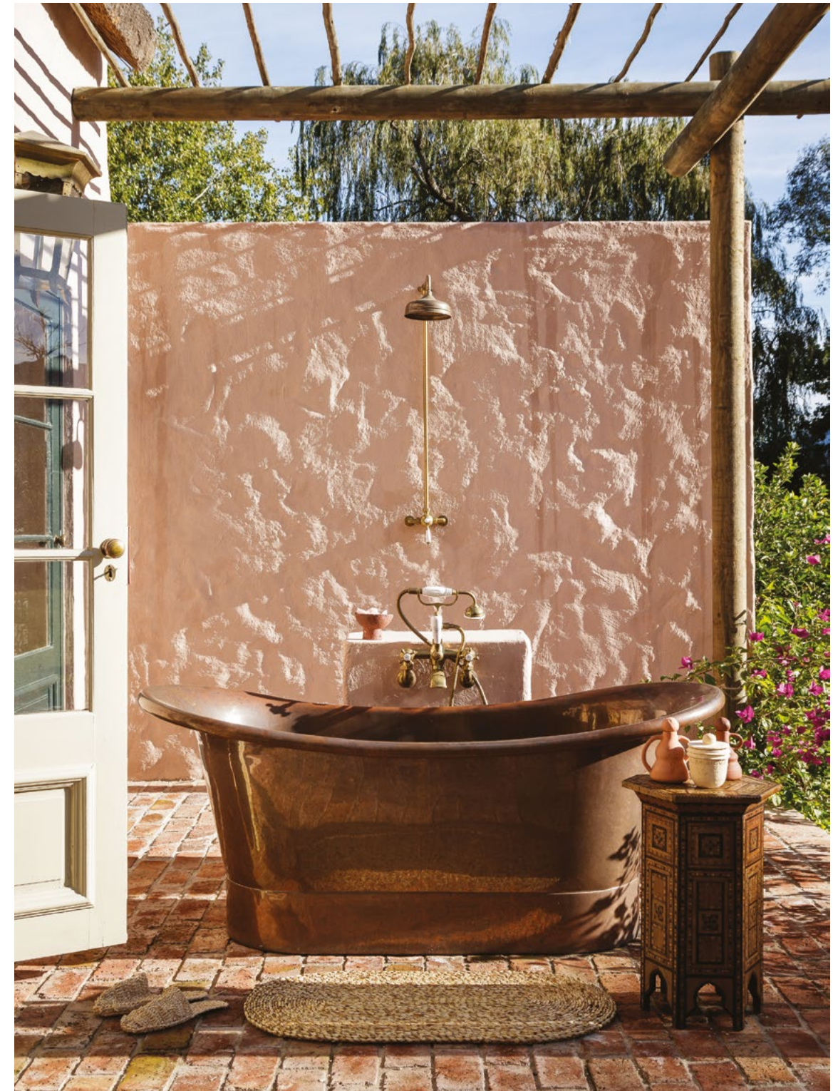
Above This outdoor shower and brass bath is the ideal spot to soak up the surrounds, with a full view of the garden beyond. Left An oversized daybed, overlooking the pool, is the perfect place to stretch out in the sun.