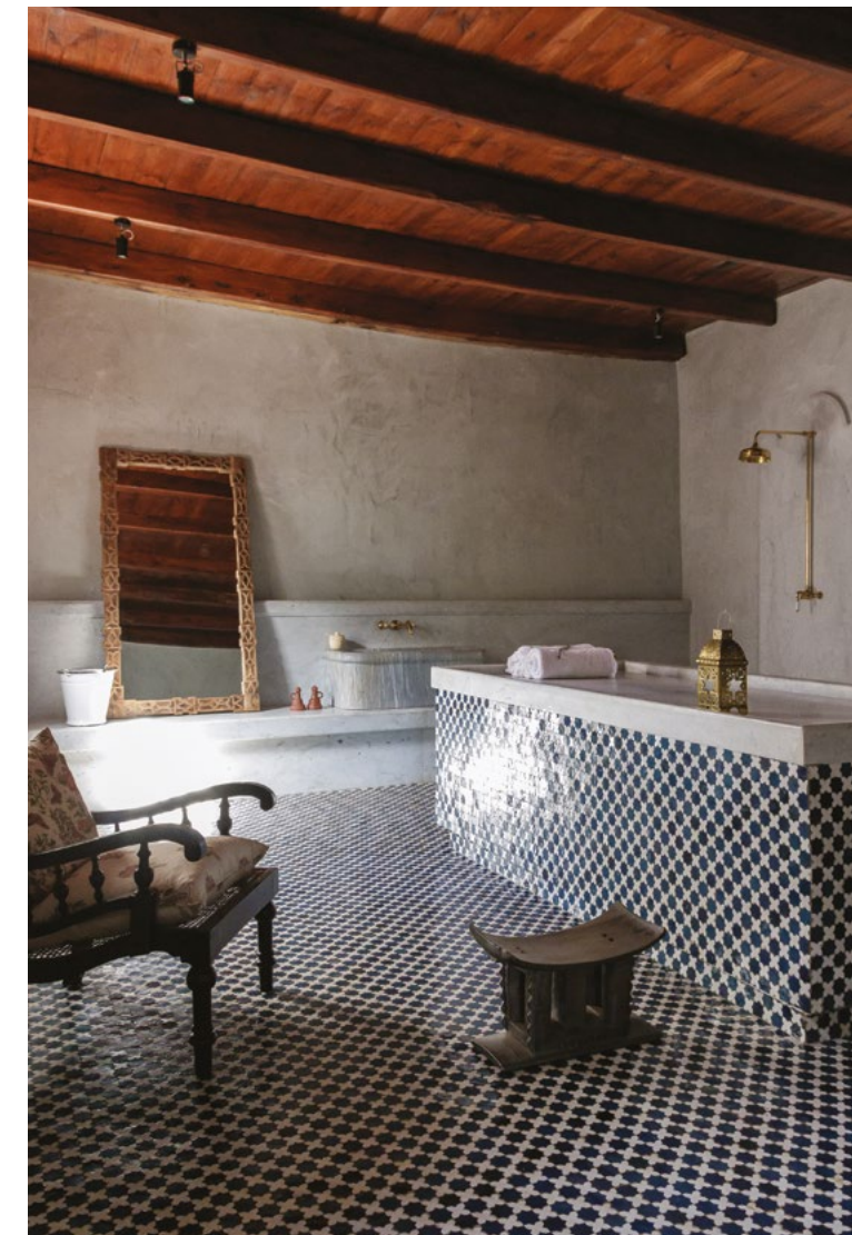
This spread The bathhouse, previously the main homestead, now houses a tented massage room, a floral treatment room, a tea room, as well as a turkish hammam, with a soon-to-be-launched herbal apothecary. Outside is a natural pool for cooling off in, the perfect spot to take in the sights and sounds of the garden.