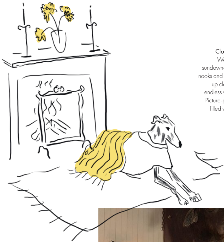
Clockwise from left The veranda in Wellington is the perfect spot for a sundowner. At Tankwa River Lodge, cosy nooks and soft spaces invite you to cuddle up close to the fire. The Blogck offers endless views over untamed wilderness. Picture-perfect Joubertsdal farmhouse is filled with the charm of days gone by.