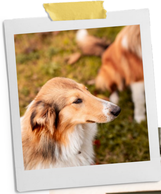
From left The pawfect pair – Tessa (left) and Pippa (below) – take their ‘meet and greet’ duties very seriously.