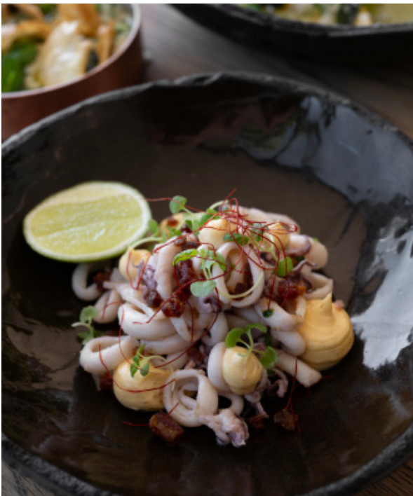
Clockwise from top: Groot Constantia estate; a dish at Chefs Warehouse, Tintswalo Atlantic. Opposite: the fishing port of Kalk Bay. PREVIOUS PAGES Left: Hout Bay. Right: colourful beach huts at Muizenberg Beach.

Kalk Bay is a cute seaside town and one of Cape Town's fishing ports. There is a restaurant dockside called Kalky's that serves the day's catch and it's loved by locals. It's very humble but has a great atmosphere and fresh seafood. I had grilled crayfish and chips for about $12. They also serve prawn fritti wrapped in newspaper, and calamari and fish. They give you salt, vinegar, lemon, and piri piri, and it's served on these colourful plastic-coated tablecloths.